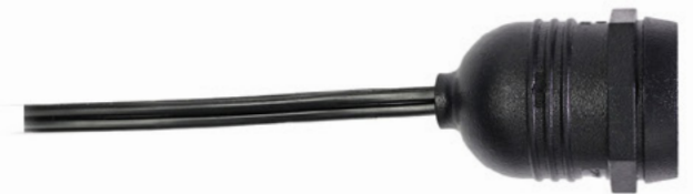
Rubberized Socket 10' of SVT cord