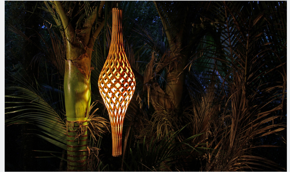
The Red Dot Award winning fixture is shown next to its namesake Nikau, an indigenous New Zealand palm tree.