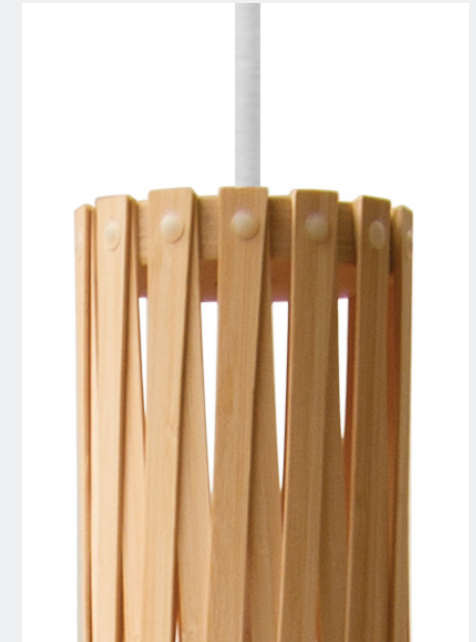
The top of the Nikau can be removed by gently pulling on the connection with the top piece. The top is then removed from the fixture for relamping, and then easily reattached by pushing the rivets back into the top piece.