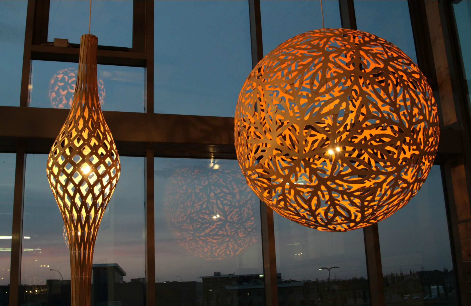
Nikau Natural Bamboo with Sola