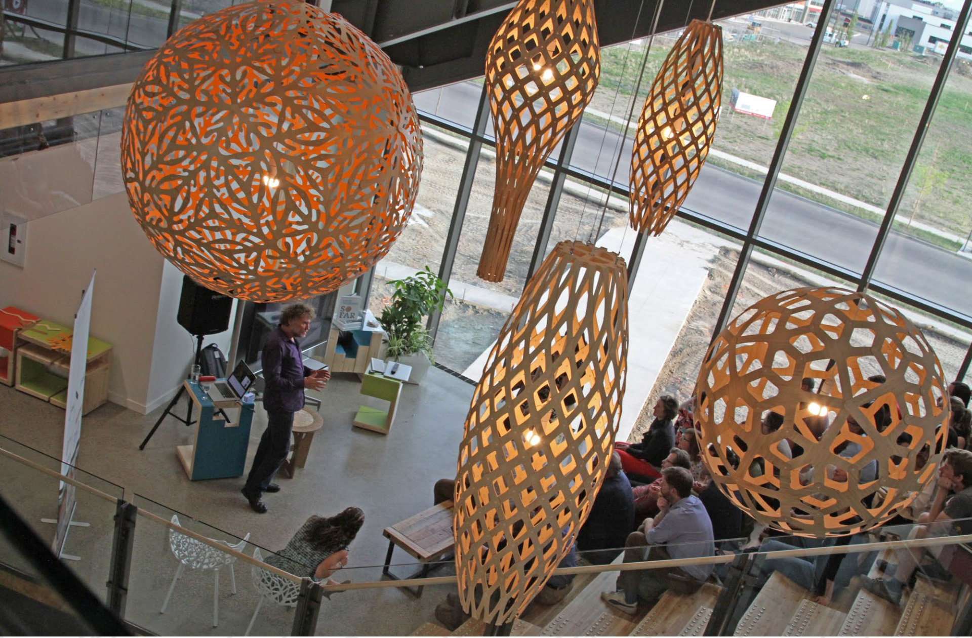
Nikau Large Natural Bamboo with Sola, Hinaki & Coral