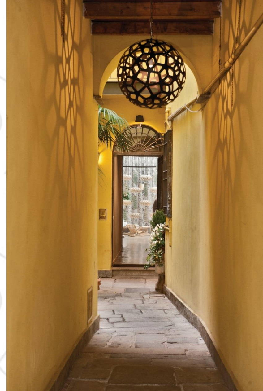
Coral 800 Natural Bamboo Black Paint Finish (two sided)

Coral 600 Natural Bamboo Lime Paint Finish (one sided)