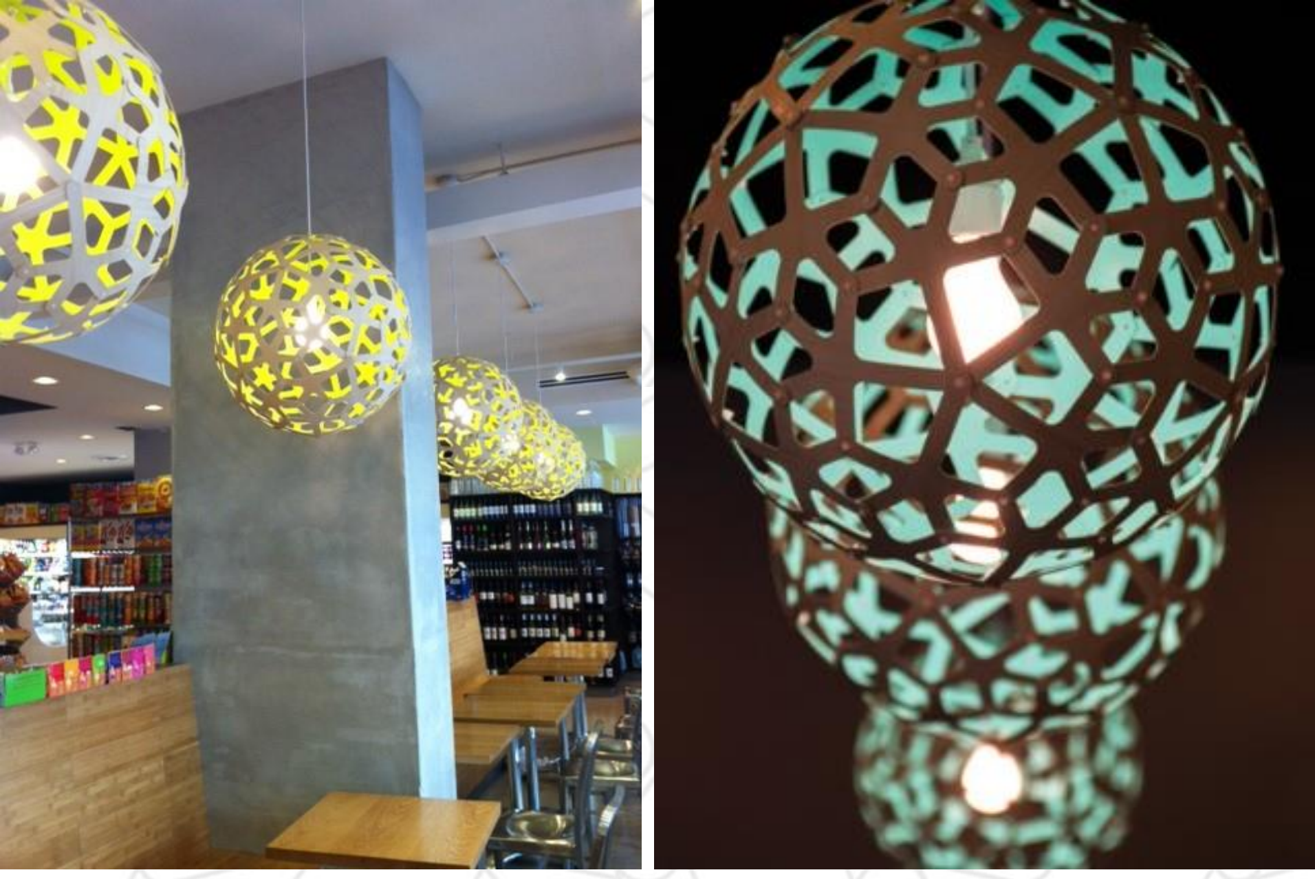
Coral 600 Natural Bamboo Lime Paint Finish (one sided)